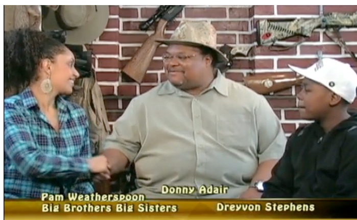
Big Brothers Big Sisters - Video Link

According to the most recent U.S Census estimates on the distribution of the U.S. population by race/ethnicity (2007) there are 37 million African Americans or about 12 percent of the total population. According to the U.S. Department of Fish and Wildlife data for the same year, only 1 percent of those who hunt are African Americans.